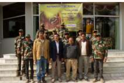
VWW workshop with Field Staff and FD