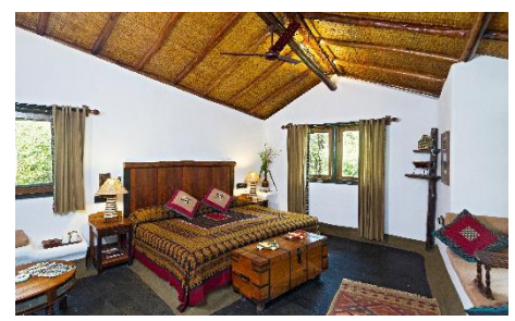
Guest cottages with ceilings naturally lined with bamboo chatai, strips of woven bamboo.

Twelve cottages in three distinct styles - nallah, forest and hill units - and luxury tents are designed with viewing decks to provide a magical experience of the wild. Buildings incorporate mud and dung plaster and