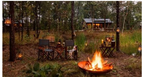
Discretely spaced, low impact tented accommodation