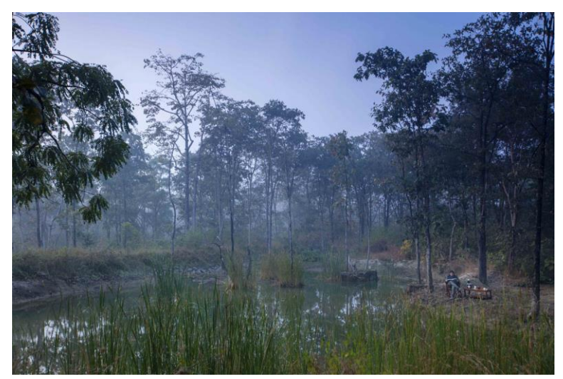
Reni Pani Jungle Lodge - buildings hidden in 30 acres of restored natural landscape giving guests a taste of the wild.