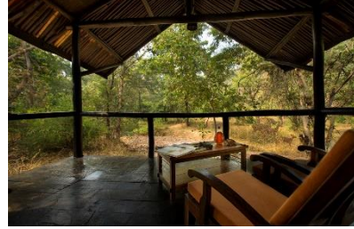
Guest accommodation platforms for wildlife watching.