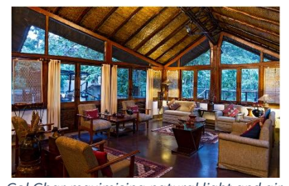
Gol Ghar maximising natural light and air with shading provided by the eaves.