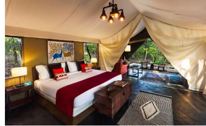
Tent interiors decorated with local art.