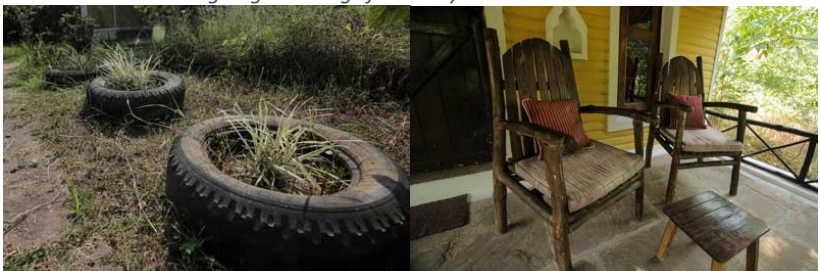
Planter made from reused tyre