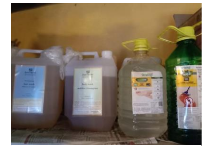
Bulk buying and refillable containers to cut down on waste.

Furniture has made good use of recycled wood. Old tyres have found a use as planters for flowers. The owner's NGO, CAT Foundation (Conservation, Art and Training) has created new self-employment opportunities for local women through workshops teaching local women how to make bags from old clothes and rugs from reused saris.