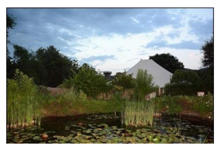
A series of pond ecosystems have been created harvesting the monsoon rains.

Oberoi Vanyavilas has created a series of lakes which harvest approximately 1,600,000 litres of rainwater each season and have become a haven for bird and pondlife. The rainwater across the property flows towards the lakes by gravity and enriches the ground water level. 135 different bird species have been recorded in the grounds including summer and winter migrants. A 300 feet deep well stores additional rainwater for irrigation.