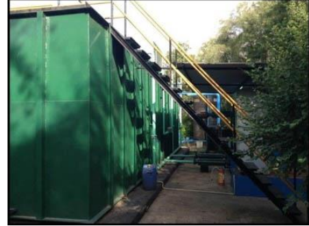
Sewage treatment plant.

The resort's sewage treatment plant enables water to be recycled for irrigation using a sprinkler and drip irrigation system reducing their use of ground water. The grounds, planted with trees, plants and naturally grown wild grasses which help to replenish the water table, cut a green swathe in the dry area of Sawai Madhopor.