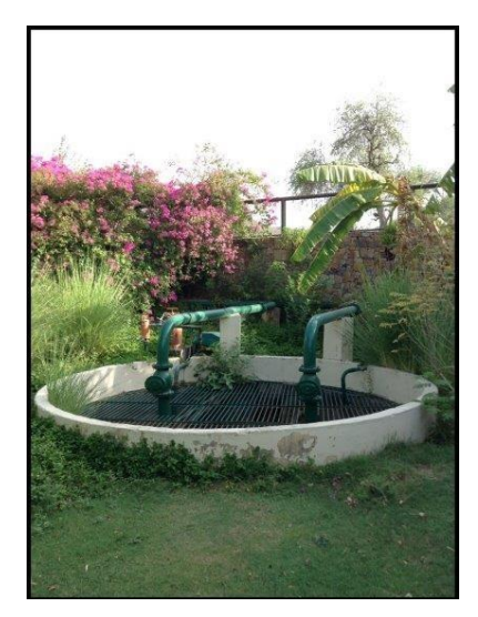
300 feet well for rainwater harvesting.

Each tent has aerated water taps, low flow showerheads and dual flushing toilets to reduce water use. Guests are encouraged to save water through notices.