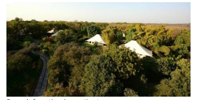
Grounds from the observation tower.