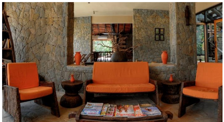
Rustic eco elegance in the common area - local stone, Gond art and furniture made from waste wood and recycled railway sleepers.

Buildings are constructed of local stone, mud plaster and terracotta tiles together with rough-hewn, recycled and sustainably sourced timber and sited next to trees to provide natural cooling. Roofs are triple layered to trap air to keep interiors cool to help conserve energy. Furniture is hand crafted from waste wood and railway sleepers which combined with the construction, earned the lodge the accolade of winning the All India Stone Architectural Awards in 2010-11.