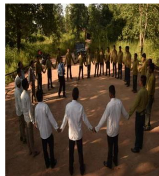
Team building, part of the lodge's training and development for staff.

Not resting on their laurels, the lodge's three expert in-house naturalists undergo annual training to continue honing their knowledge and skills. Guests benefit from a range of inspiring experiences accompanied by a naturalist including nature walks, a tree trail, birding, cycling expeditions and Forest Bathing, a Japanese technique harnessing the natural therapeutic power of trees.