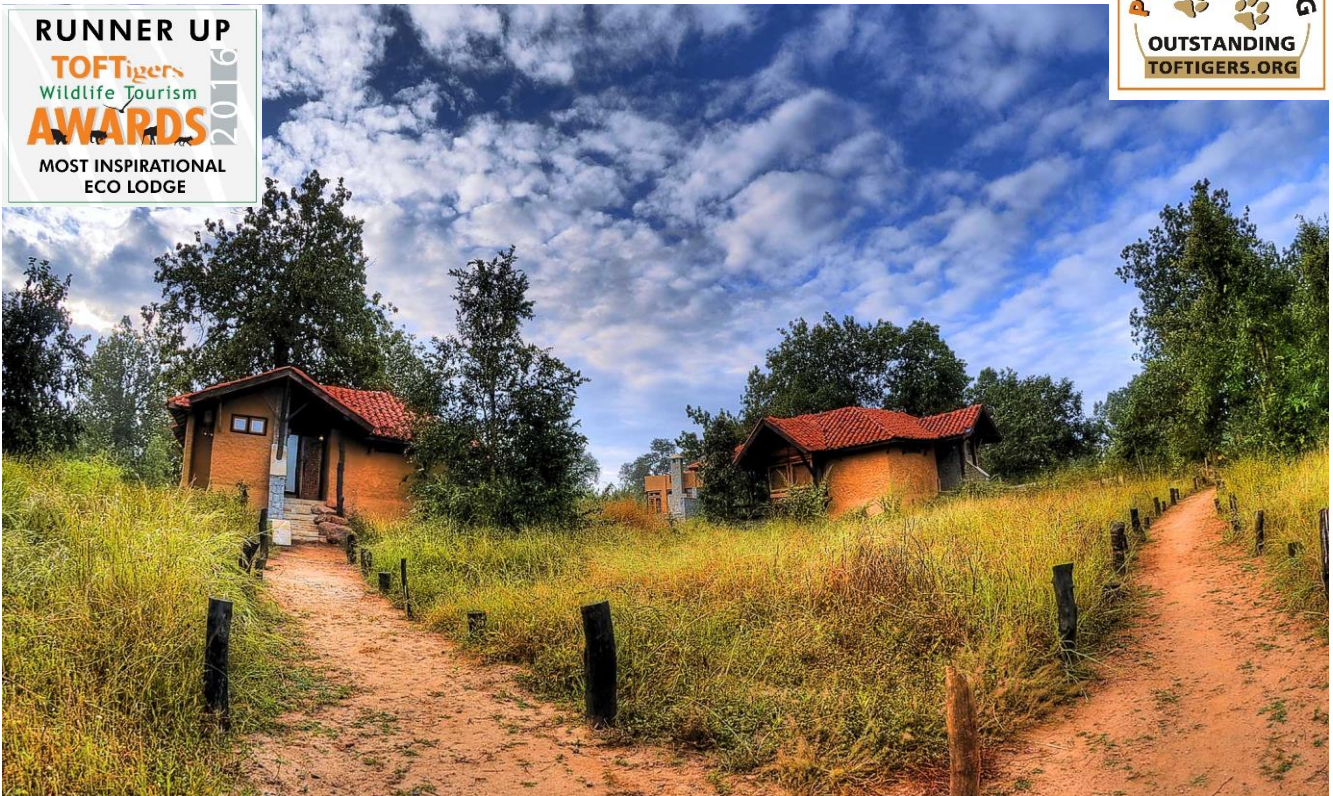
Guest cottages reflect local Gond architecture and are built of local materials. Grounds with indigenous planting left wild and natural pathways help to recharge ground water.

Kanha Earth Lodge marries inspiring architecture and rustic charm with conservation through its eco operations and promoting a passion for nature. Located near Narna, a small tribal village, the site was chosen in a new area to offer guests an immersive wildlife experience away from the madding crowd and to spread the benefits of tourism. Underpinned by consultation with the local community, the lodge has been designed to reflect the local vernacular architecture with verandas, pitched roofs and deep overhangs providing natural shade. The sixteen-acre grounds, restored with indigenous trees and grasses, have been left natural with not a single tree lost during construction.