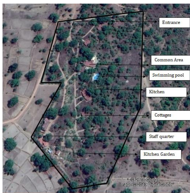
Not a single tree was cut down during construction and further trees have been planted.

The lodge sponsors a teacher at the local school and provides support with books and stationery. Pupils are educated about the importance of their natural heritage by the lodge naturalists. Donations are given to three local villages to support festivals and local events. Guests are encouraged to support local projects and conservation.