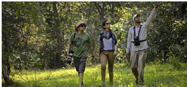
Guests enjoying a nature walk with lodge naturalist.

Local villagers involved in the construction have progressed to new positions with a positive programme of skills development and awareness of the company's sustainability ethos woven into training. Young local recruits have become managers inspiring fellow villagers. More than 70% of lodge employees are from the local area. 70% of revenue is pumped back into the local economy through salaries, an active local procurement policy, vehicle hire, park fees and taxes.