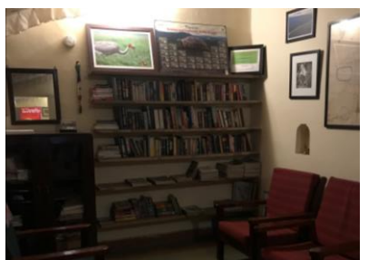
A well-maintained library within the lodge on the region's natural and cultural heritage is provided to educate guests.