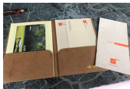
Guest briefing materials include a checklist of birds, mammals, reptiles and butterflies to look out for.