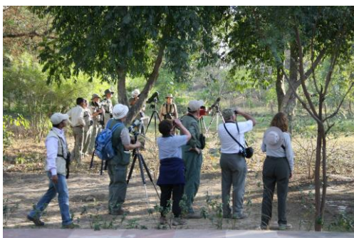
Birdwatching activities at Mela Kothi

Two International Bird Festivals in 2015 and 2016 hosted at the lodge with over 200 experts from 29 countries in 2016 have put the Chambal Valley firmly on the international conservation map to help secure its continuing protection. The lodge's Chambal Conservation Foundation is playing an active role in providing intelligence on wildlife and protecting the gharial population, a critically endangered species.