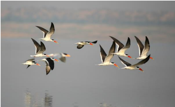
Indian Skimmer, one of over 300 species of bird documented in the Chambal Valley.

Mela Kothi is an outstanding example of wildlife conservation working hand in hand with sustainable tourism. Lodge owners Ram Pratap Singh and Anu Dhillon are helping to protect and regenerate the natural and cultural heritage of a previously little-known area through the Chambal Conservation Foundation, set up with their own funds.