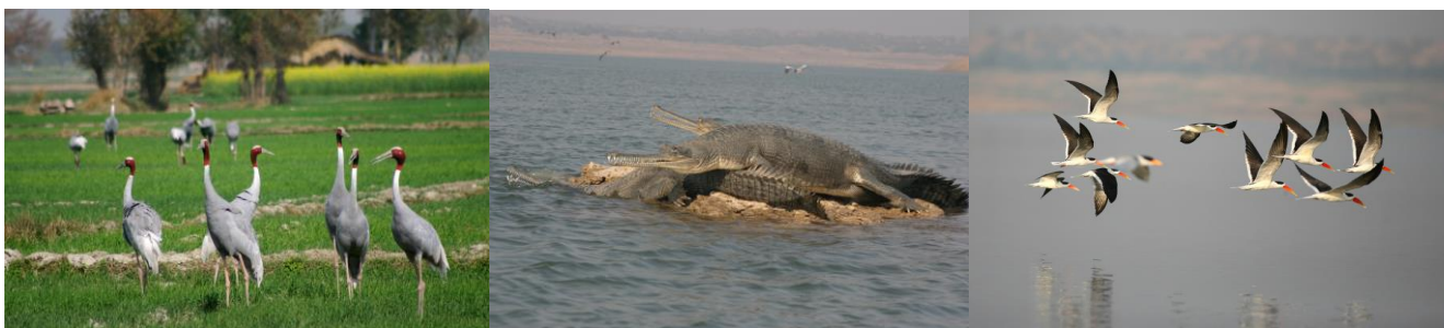
Putting birdlife on the international map and protecting gharials, a critically endangered species on IUCN's Red List

LED bulbs used extensively throughout the property and star rated appliances minimise energy. The purchase of local produce is a priority to reduce carbon footprint and support local enterprise. Water conservation measures are in place to complement the lodge's rainwater harvesting, natural pathways and planting with indigenous trees and shrubs which help to replenish ground water.