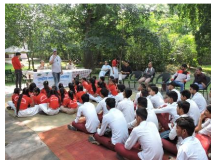
Wildlife Week celebration and awareness camp for students has attracted close to 20,000 children from Agra and rural schools since 2004.