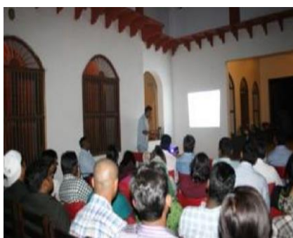
Forestry probationers training camp held at the lodge.