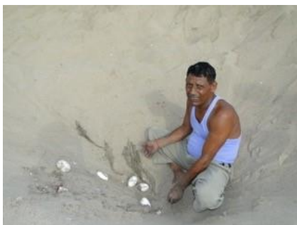
The Foundation provides ongoing support for census and conservation.