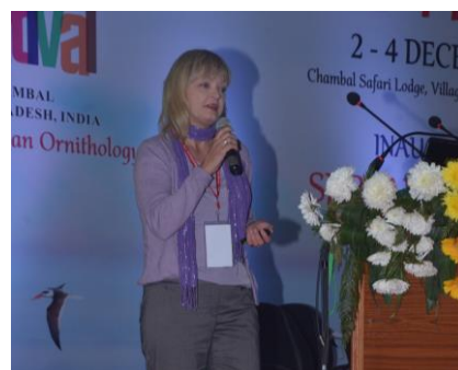
International Bird Festivals in 2015 and 2016 attended by experts from 29 countries in 2016 have put the Chambal Valley on the international conservation map.