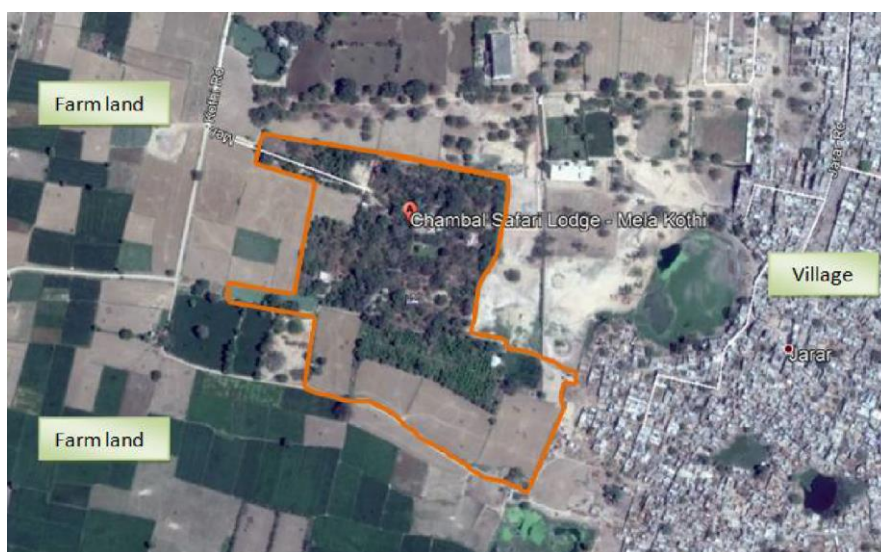
Restored landscape in lodge grounds through extensive tree planting.