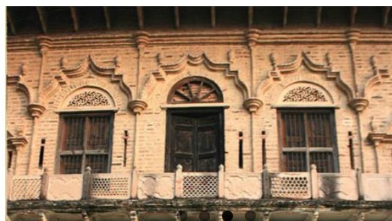
Nearby Holipura declared a heritage village with guided tours opening up new livelihood opportunities for local people.

A range of new businesses and livelihood opportunities for local communities have been catalysed with their support including dhabas (eateries), homestays and guided tours. Camel safaris are operated with the help of local camel-owners, marginal farmers who formerly used their camels for ferrying illegally felled timber. The lodge is also part of an innovative 207 km bicycle highway launched in 2016 as a tourism and social outreach project connecting 92 remote villages. A further enterprise initiative is under development for the community using local waste products (rags, paper and agricultural waste) to manufacture handmade paper and generate clean power. Most of the lodge's 32 staff are local, three of them female.