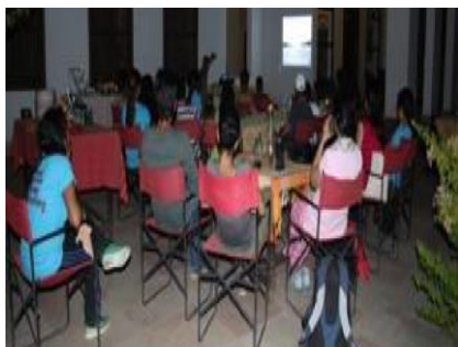
Presentation on World Turtle Day in the lodge to raise awareness.