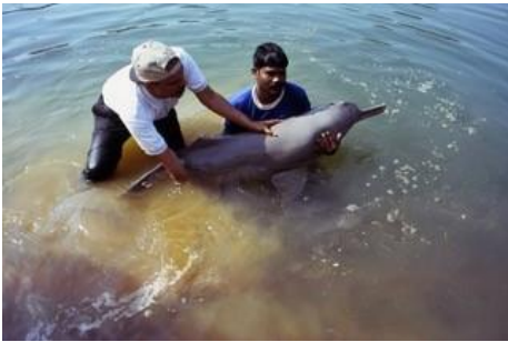
Participating in the state-wide Dolphin Census in 2006, 2012 and 2015.

Intelligence on wildlife is regularly provided to national and international conservation organisations. The Foundation worked with the US Peregrine Fund in 2006 to identify vulture nests in the Chambal Valley and contributed to the state-wide WWF, Forest Department Dolphin Census in 2006, 2012 and 2015. It participates in and hosts the team for the National Chambal Sanctuary's annual census carried out by the Forest Department and WWF. Detailed scientific listings of bird, mammal and reptile sightings have been compiled which are revised and updated each year. Listing of flora has also been initiated.