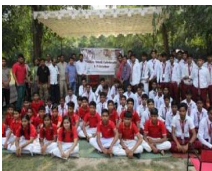
Conservation briefing for school students.