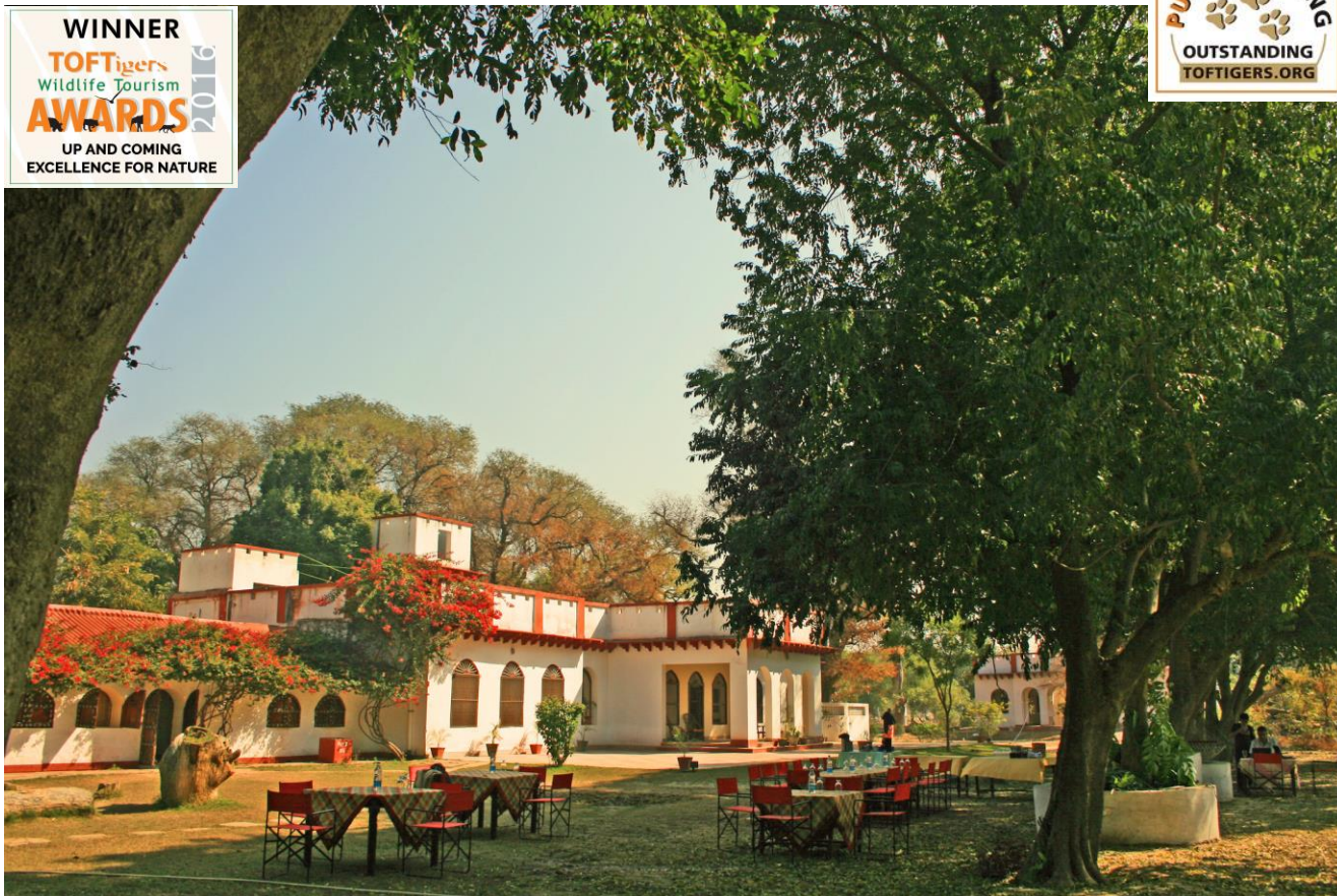
Transformation of a 19th century heritage property into an eco-enterprise – a hub for nature and cultural heritage restoration.

Mela Kothi - Chambal Safari Lodge is a shining example of how a heritage property can be transformed into a thriving eco-enterprise which is helping to restore and protect the natural and cultural heritage of a previously little-known area. Conservationists Ram Pratap Singh and Anu Dhillon have lovingly restored their 19 th century family inheritance. Its surrounding 35 acres near the National Chambal Sanctuary have been transformed into a thriving habitat of woodland, pasture and water bodies. 198 species of birds, mammals and reptiles can now be spotted in and around the property.