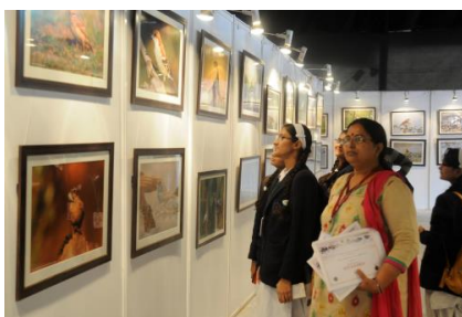
An exhibition of more than 200 photographs and paintings complemented interactive workshops and talks at the Festivals.