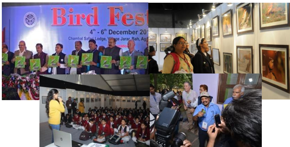
2015, 2016 - International Bird Festival success story.

Compiled for TOFTigers by Positive Nature in consultation with Sycom Projects Consultants Pvt Ltd October 2019 For press and publication enquiries contact: admin@toftindia.org