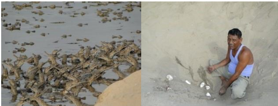
Ongoing support for gharial conservation is helping to ensure this critically endangered species continues to thrive after the Gharial crisis of 2007.

The Foundation supports and contributes to the Forest Department's anti-poaching activities and efforts to eliminate illegal sand-mining operations. The lodge's boats are used for patrolling and a check-post has been created at a vital junction reducing the incidence of both these threats. Central to the lodge's approach is also helping establish and revive eco-development activities bringing new employment and economic benefit for the local population to ensure their participation in conservation and protection efforts. The foundation is actively involved in eco-tourism policy and setting guidelines for carrying capacity in the Sanctuaries and National Parks of Uttar Pradesh to ensure sustainable development.