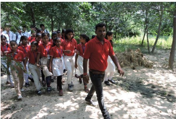
Children taking part in Wildlife Week celebrations.

It plays an impressive role in nature education and conservation awareness. Nearly 20,000 children from Agra and local rural schools have participated in the Foundation's annual Wildlife Conservation Week which involves talks, competitions and visits to Protected Areas near Agra including the National Chambal Sanctuary. Awareness camps and interactive meetings are organised in partnership with the Forest Department for local communities to strike a balance between divergent needs.