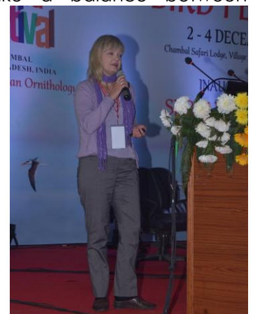
International Bird Festivals with speakers from 29 countries in 2016.

Two UP International Bird Festivals organised at the lodge in 2015 and 2016 in partnership with the UP Forest Department raised the profile of this little-known valley to help secure its continuing protection. Over 200 experts from 29 countries were involved in 2016 including representatives from WWF, BNHS, Bird Life International, Wildlife SOS and the Nature Conservation Fund. Interactive workshops and talks were complemented by bird-ringing demonstrations and an exhibition of more than 200 photographs and paintings. Over 2,000 people attended in 2015 and 2016 including over 400 school children in 2015 and 500 in 2016.