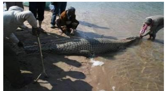
Participating in the Gharial crisis in 2007.

The Foundation has been actively assisting the Gharial Crisis Management and WWF at a field level since a crisis in December 2007 saw massive deaths of this critically endangered species in the Chambal River, home to half of the world's population. Every year, it identifies and provides protective covers for gharial and mugger nesting sites. It is also working with WWF on a Chambal river basin management plan.