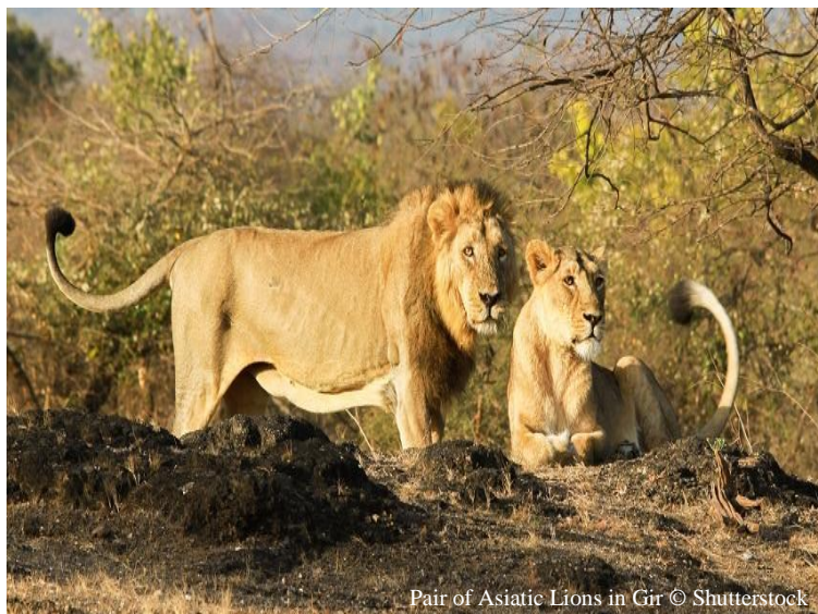
Pair of Asiatic Lions in Gir

Rugged, scraggly, brown and dry, Gir is best known as the last bastion of the Asiatic lion. A beautiful hilly but harsh, and thorny habitat in southern Gujarat is the last remnant of the native landscape within the Saurashtra peninsula and is often compared to the African bushveld. The lions that once ranged from Asia Minor to the northern plains of India almost came to the brink of extinction, due to a combination of reduced habitat and mindless hunting. Today, roughly 526 of them can be found in and around Gir, the only individuals left on the subcontinent. While on your safari, don't be surprised if you find tribesmen roaming this lion country on foot with their cattle without a care. They are from the Maldhari tribe which translates to 'owner of animals'. These colourful, nomadic people have lived alongside lions for millennia, with mutual respect. The park will remain closed for visitors for four months