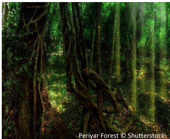
Periyar Forest

One of the most visited, protected areas in India, Periyar Tiger Reserve toils hard to maintain its viable habitat for tigers by ensuring the conservation of biodiversity with minimal human-wildlife conflicts. They steadfastly seek to secure the coexistence of wildlife and human activity with due recognition of the livelihood, development, and social and cultural rights of local people.