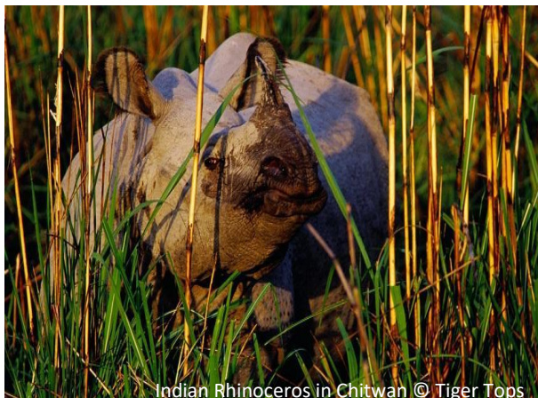
Indian Rhinoceros in Chitwan

As one of the first parks to see tigers regularly in the 1970s, the rich biodiversity of the highly acclaimed Chitwan National Park has earned its status as a World Heritage Site, and as one of the last surviving examples of the natural ecosystems of the Terai region. It declared the country's first National Park in 1973 and holds within its boundary a Ramsar Wetland site and the Beezashari Lake. It is a treasure trove for nature enthusiasts and an early pioneer in some of the best practices of nature tourism and wildlife conservation. In these forests, you will find a diversity of fauna from the largest terrestrial mammal, the elephant, to the smallest the pygmy shrew. It is the most well-known, for one-horned rhinos and the Bengal tiger. There has been a recent revival in the population of tigers, and