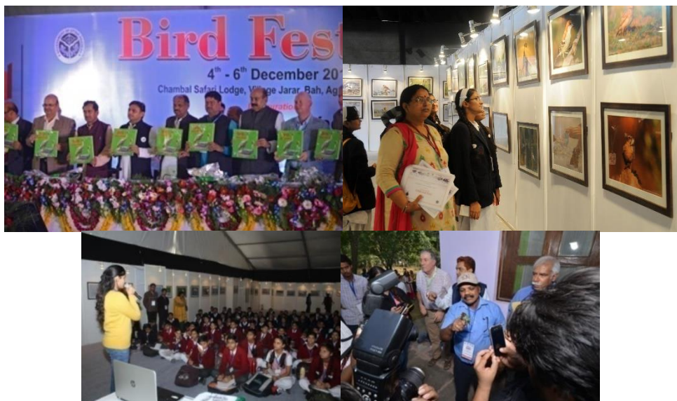
2015, 2016 - International Bird Festival success story.