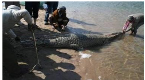
Participating in the Gharial crisis in 2007.

The Foundation has been actively assisting the Gharial Crisis Management and WWF at a field level since a crisis in December 2007 saw massive deaths of this critically endangered species in the Chambal River, home to half of the world's population. Every year, it identifies and provides protective covers for gharial and mugger nesting sites. It is also working with WWF on a Chambal river basin management plan.