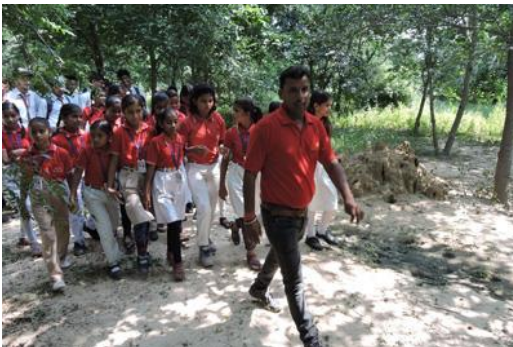
Children taking part in Wildlife Week celebrations.