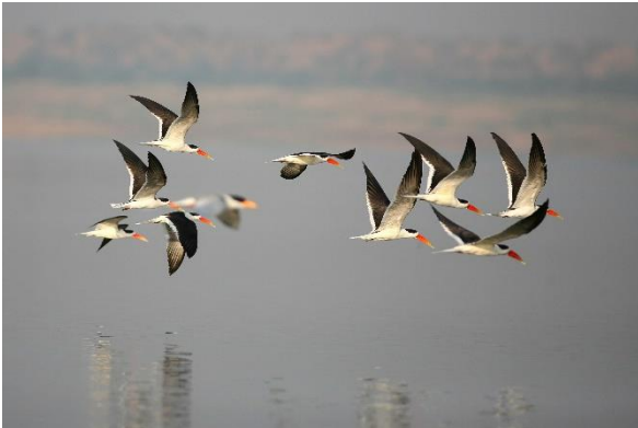
Indian Skimmer, one of over 300 species of bird documented in the Chambal Valley.