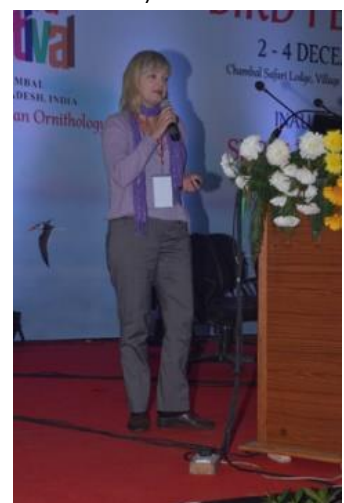
International Bird Festivals with speakers from 29 countries in 2016.

Two Uttar Pradesh International Bird Festivals organised at the lodge in 2015 and 2016 in partnership with the UP Forest Department raised the profile of this little-known valley to help secure its continuing protection. Over 200 experts from 29 countries were involved in 2016 including representatives from WWF , Bombay Natural History Society , Bird Life International , Wildlife SOS and the Nature Conservation Foundation . Interactive workshops and talks were complemented by bird-ringing demonstrations and an exhibition of more than 200 photographs and paintings. Over 2000 people attended in 2015 and 2016 including over 400 school children in 2015 and 500 in 2016.