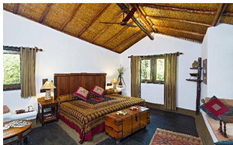
Guest cottages with ceilings naturally lined with bamboo chatai, strips of woven bamboo.

Built on 35 acres of degraded forest, Reni Pani is constructed using locally sourced materials to blend with the surrounding regenerated forest. Existing trees on the site were retained. A further 2,500 indigenous saplings planted since 2009 have restored the site to a thriving forest and habitat for wildlife including breeding sloth bears, leopards, wild boar, porcupine, rusty spotted cat, jungle cat, palm and Indian civets, sambar deer, resident herd of spotted deer and numerous bird species.