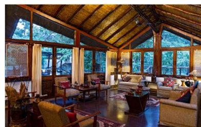
Gol Ghar maximising natural light and air with shading provided by the eaves.