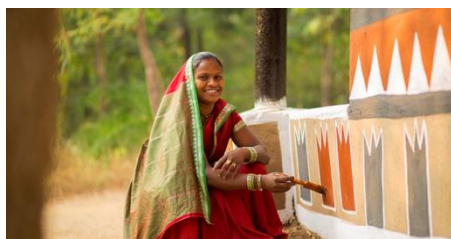
Traditional wall decoration by local women.