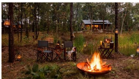
Discretely spaced, low impact tented accommodation.

Traditional wall paintings made by local women using natural paints and extensive use of local Gond art reflect local culture. Dustbins are made by local weavers. Pathways are made with sawdust avoiding the use of cement. Aerated taps and flow flow showerheads and dual flushing toilets help to minimise water use. Solar power is used to heat water in staff accommodation. The use of LED bulbs is maximised to save energy.