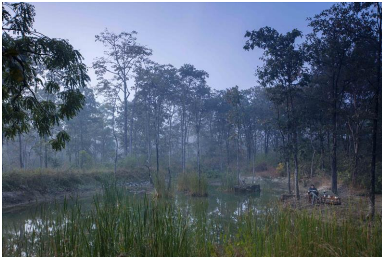
Reni Pani Jungle Lodge - buildings hidden in 30 acres of restored natural landscape giving guests a taste of the wild.

Built on 35 acres of degraded forest, Reni Pani is constructed using locally sourced materials to blend with the surrounding regenerated forest. Existing trees on the site were retained. A further 2,500 indigenous saplings planted since 2009 have restored the site to a thriving forest and habitat for wildlife including breeding sloth bears, leopards, wild boar, porcupine, rusty spotted cat, jungle cat, palm and Indian civets, sambar deer, resident herd of spotted deer and numerous bird species.