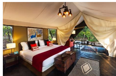
Tent interiors decorated with local art.