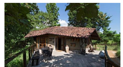
Shop selling local artefacts made with traditional, mud wall and local tiles.