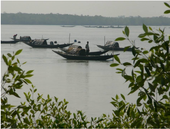
Helping to protect a UNESCO world heritage site through sustainable tourism