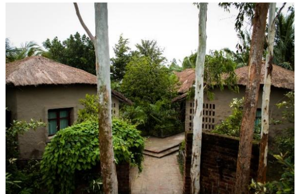
Low impact buildings reflecting local culture.

The resort is located on Bali Island in West Bengal, an area with 37,000 inhabitants spread across fifteen villages. With limited resources and a growing population, the island was a hotspot for the illegal wildlife trade with constant pressure on youth to find new opportunities for employment.