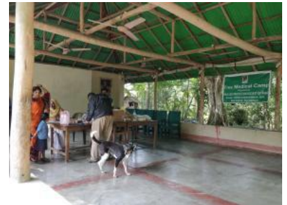
Health Check-up camp organised at WPSI's centre in the resort's grounds

The combined social and livelihood improvements provided by WPSI, BNWCS and Tora Eco Resort are having a positive impact on conservation. Poaching has practically been reduced to zero and when a tiger strays onto the island, the community assists the Forest Department to capture and release it back to the wild. A win-win situation for wildlife and communities.