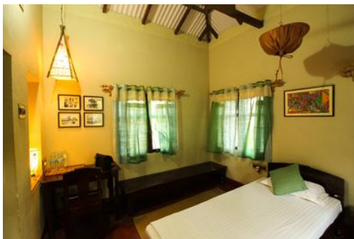
Guest accommodation supporting local livelihoods.

Guest cottages built in the rural style from local materials with mud walls and thatch are designed to minimise impact on the area. Planting with indigenous trees, shrubs and grasses in the grounds and a natural pond recharge ground water. Trees provide natural shading and cooling; there is no air conditioning to minimise energy use.