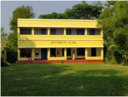
WPSI Serenity School supported by the resort.

The resort supports WPSI in running a small school located on the resort's boundary and has also contributed to a hospital managed by Samarpan Foundation. WPSI's other activities from its base on the island include assisting the Forest Department with anti-poaching activities, outreach conservation awareness programmes in outlying villages and environmental education in local schools.