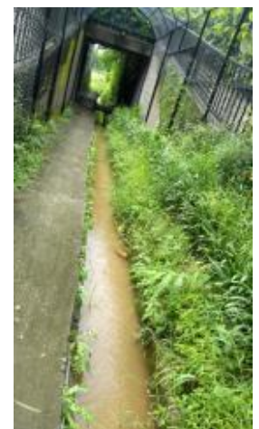
Pathway created on the lodge premises to enable villagers to access a free-flowing water channel.