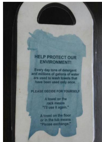
Encouraging guests to save water.