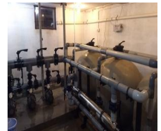
UV filter is used to treat water from the swimming

Guests are encouraged to conserve water through notices encouraging the re-use of towels and linen. Dual flush toilets and aerated taps are in place to reduce water consumption.