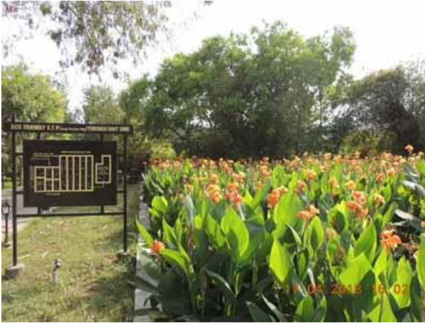
Aahana houses one of the largest natural STPs in Asia